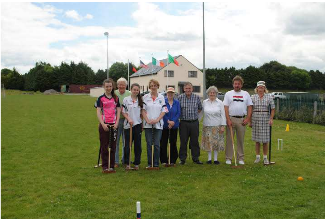
Croquet Demonstration provided by members of the Carrickmines Croquet and Lawn Tennis Club at Swinford Amenity Park on 27th June 2014

It is our commitment to Build Bridges in our Community by promoting Equal Inclusion for ALL .